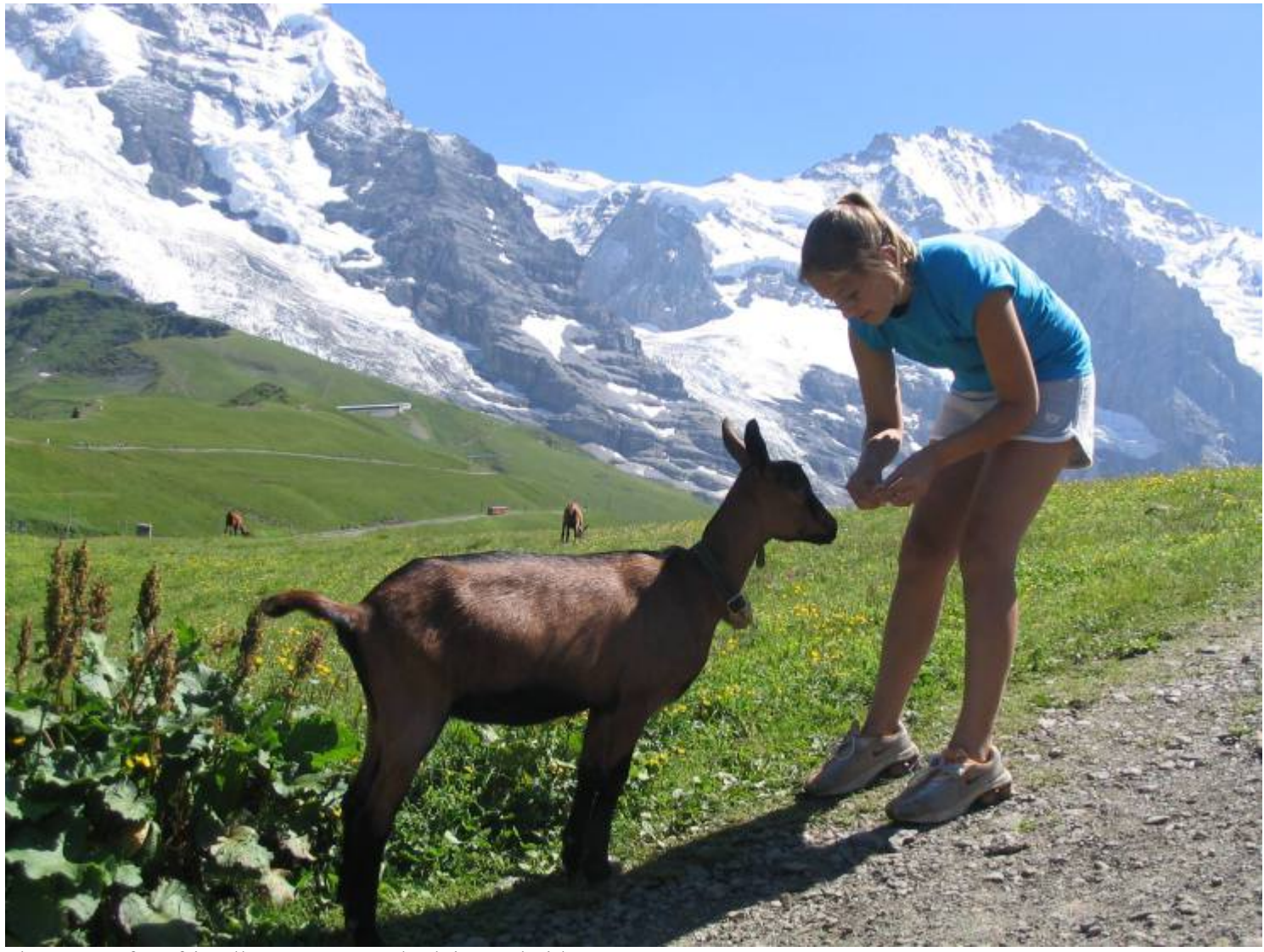
There are often friendly goats around Kleine Scheidegg.