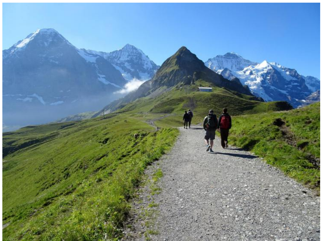
The trail ends up under that little cloud in the middle of the picture, at Kleine Scheidegg. Fairly level and smooth for walking.

Every time I've been to Mannlichen there are cows there. You can pet them if you use your common sense.