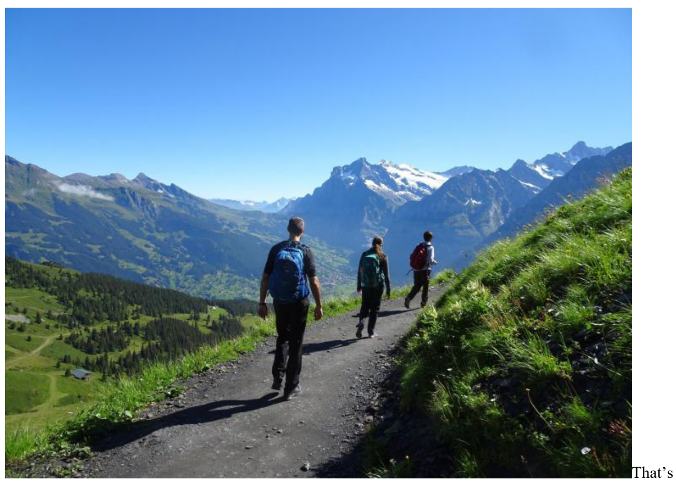
Grindelwald in the distant valley, and First is behind that cloud on the left.